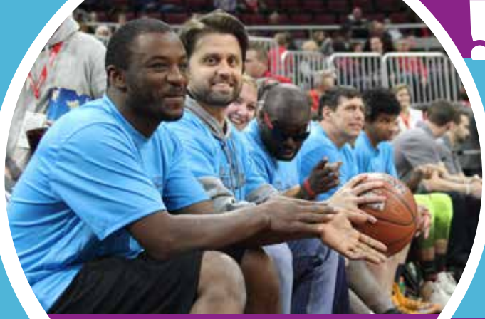
EPIC Bulldogs - Like us on Facebook to see more images!

At EPIC we enrich the lives of individuals with intellectual and developmental disabilities. We envision a world where people with disabilities are respected, engaged in community life, and have every opportunity to achieve their personal best.