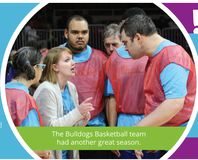
The Bulldogs Basketball team had another great season.

At EPIC we enrich the lives of people with intellectual and developmental disabilities. We envision a world where people with disabilities are respected, engaged in their communities, and have every opportunity to achieve their personal best.