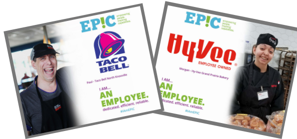
*Event Sign Example

With a focus on EP!C's employment partners you can get your business in front of a captivated audience of around 100 golfers.