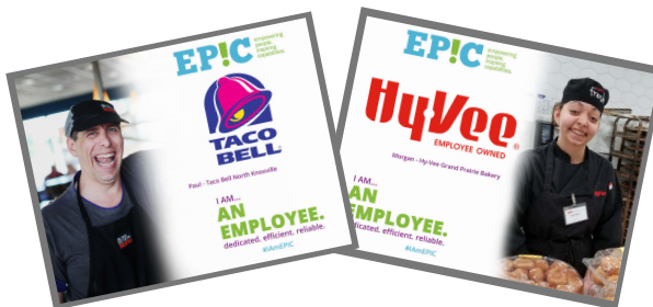
*Event Sign Example

With a focus on EP!C's employment partners you can get your business in front of a captivated audience of around 100 golfers.