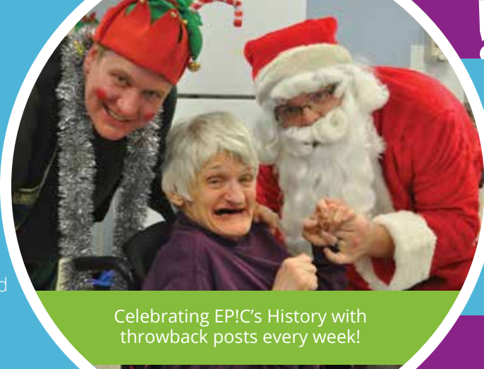
Celebrating EPIC's History with throwback posts every week!

At EPIC we enrich the lives of people with intellectual and developmental disabilities. We envision a world where people with disabilities are respected, engaged in their communities, and have every opportunity to achieve their personal best.