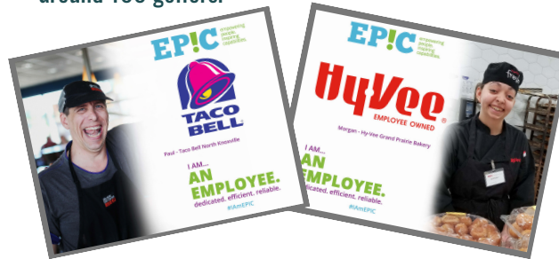
*Event Sign Example

With a focus on EP!C's employment partners you can get your business in front of a captivated audience of around 100 golfers.